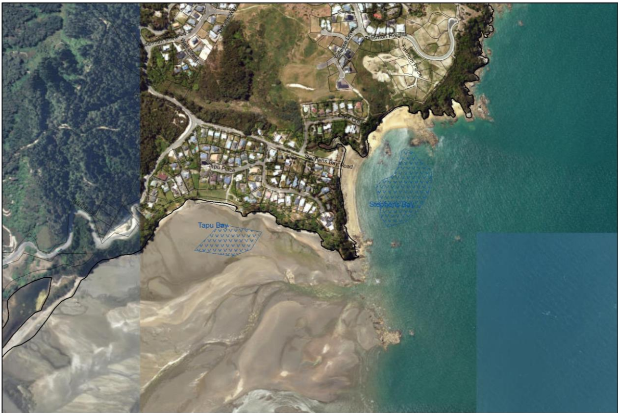
Map 180C: Tapu Bay - Stephens Bay