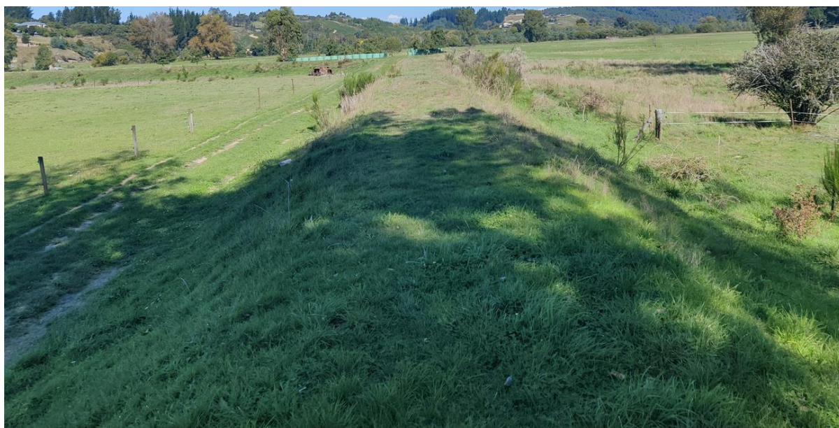
Figure 1: Photograph of stopbank taken during site walkover on 9/3/22